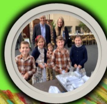
“Feel Good” Service